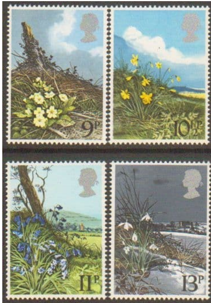
1979 UK Spring flower stamp set